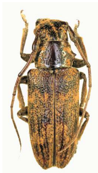
Fig. 3. Filipinmulciber palawanus Vives, 2015 (Vives 2015)