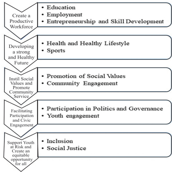
Fig. 2: Vision, Objectives and Priority Areas in NYP, 2014.

The new National Youth Policy-2014 identifies a vision comprising of 5 key objectives differentiated into 11 priority areas determined by the indicators to evaluate the accomplishments within these specified priority areas. Let us now analyse the vision of this policy as described in the diagram 1 given below (NYP, 2014).