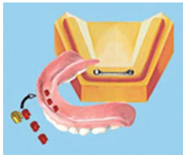
Fig. 2 Hader bar and Hader Vertical

Make a full arch pick-up impression with a rigid impression material such as polyether, fabricate the master cast and select matching plastic UCLA abutments. Adjust the length of the plastic bar & connect the plastic bar to the UCLA abutments with wax, sprue the bar and UCLA abutments. Complete the casting procedure. Finish and polish the casting. Try the bar intraorally and radiographically for oral fit. Insert the bar on the master cast, snap plastic clips on the bar. Insert as many clips on the bar according to available space. Block out the undercuts. Duplicate cast is obtained from the master cast.