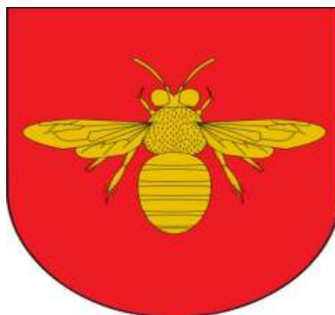
Fig-1: Former coat of arms of Abella de la Conca, Lleida, Spain [12].

During Ottoman Empire Code of Common Law legislated between 1477-1481 mentioned about some taxes which got from beekeepers [7]. The taxes used to apply for honey and beehives in different amounts. Later than beehive tax was cancelled but honey tax continued to apply. The amount of the tax was 10% apart from self requirement of producer. In Istanbul there were about 35 wax shops in 1782. Ottomans conquered 'Eflak' (Southern Romania) in 1394 and 'Bogdan' (Moldova) in 1455. Eflak and Bogdan were important sources of grains, large ruminants, honey, wax and dairy products for Ottoman Empire. Those products were bought in local markets in Eflak and Bogdan by Balkanian merchants and sold in Istanbul bazaars. The commercial goods used to carry via The Danube River.