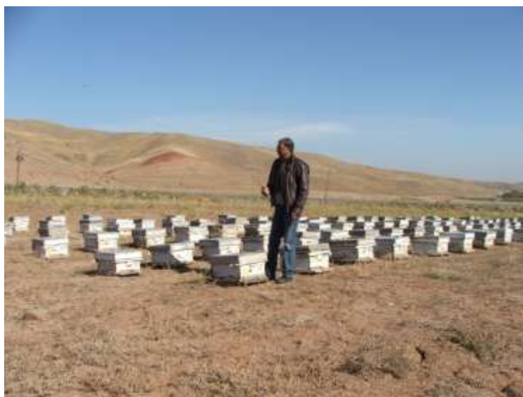
Fig-2. A beekeeper on duty in fall season.

Because of topographic conditions, flowering seasons spread out different time of a year. Hence migratory beekeeping is very common in Turkey [25]. In this system bee hives are moved from one place to another place by following nectar flow seasons on different regions. The beekeepers are generally professional and they keep about 100-400 bee colonies, sometimes up to 1000. The most beekeepers are live in Province of Ordu located in Eastern Black Sea Region. On the other hand migratory beekeeping homogenize bee breeds and so genetic variation reduces [4]. For example percentage of local beekeeping (Figure 2) is about 8%, but percentage of migratory beekeeping is about 92% in Province of Agri. Although percentage of 50% belongs to migratory beekeeping, honey production percentage is about 80% in Turkey. It showed that migratory beekeeping increase the honey production [26, 27]. In Province of Bingol, ratio of 51% is migratory beekeeper. Generally middle age people deal with migratory beekeeping. Young people are not interested in migratory beekeeping because they are far away for months and long for their homes. Migratory beekeepers generally keep bee colonies more than 100 colonies [27].