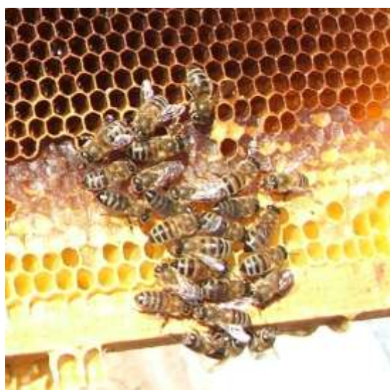
Fig-5: A group of Anatolian Bee on a comb.