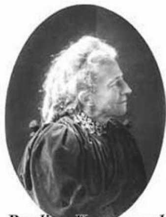
Pauline Kergomard Fig. 1.

The idea of the theoretical presentation of the life and educational views of French educator Pauline Kergomard is dedicated to the 180 th anniversary of her birth. This is one of the forgotten and little-known names with an unique contribution to pedagogical theory and also to the organization of kindergartens and preschools. The review of the educational philosophy and pedagogical practice presented in this article relates to the preparation of students in "Pre-school Pedagogy" and broadened the horizons of the kindergarten teachers.