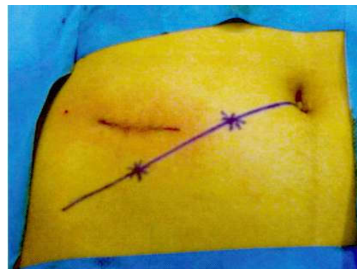
Lanz Incision L

An incision is made perpendicular to the McBURNEYS point. This is also known as a gridiron