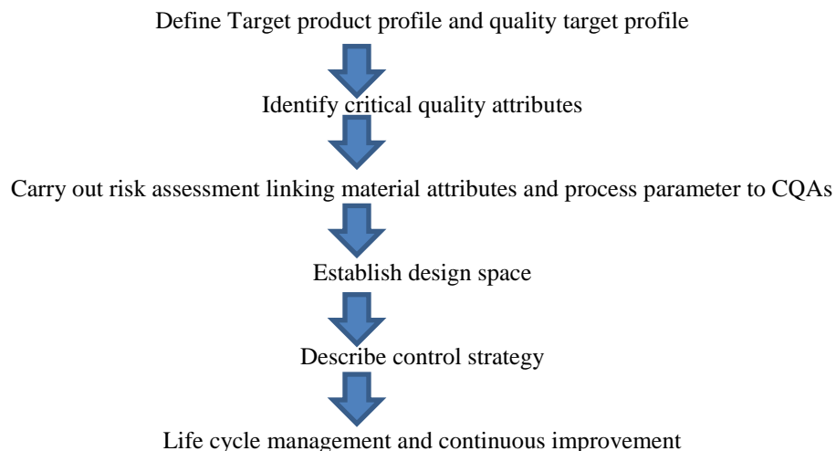
Fig. 2: QbD Flow chart