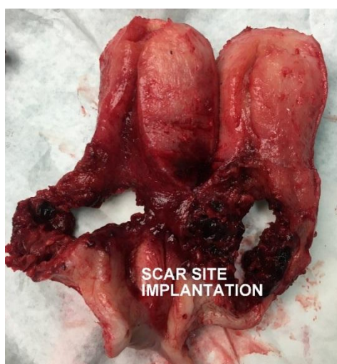
Fig-3: hysterectomy specimen confirming scar site ectopic pregnancy

from the lower uterine segment from the previous scar site. The mass was of 5 x 4 cm. Cervix was normal with no growth and the uterine cavity was empty in the fundal region. The procedure was continued and hysterectomy done. The finding confirmed the diagnosis of scar pregnancy which was reconfirmed by the HPE report.