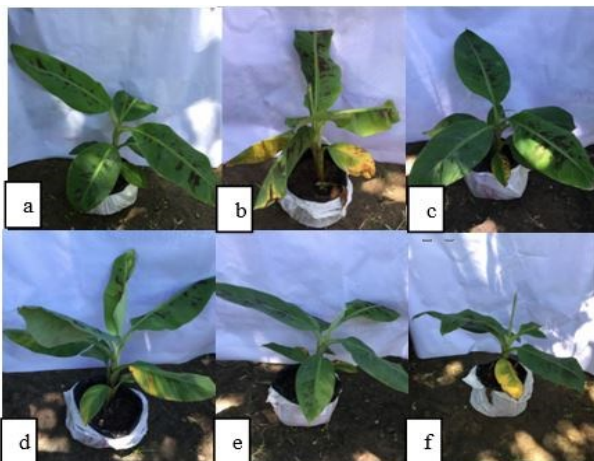
Fig. 3. Leaf severity index (LSI) of Fusarium wilt on 'Cavendish' banana as affected by different rates of VT supplemented by EM; a. Negative Control; b. Positive control; c. Vermicompost Tea (66.67ml) + EM (40ml/L); d. Vermicompost Tea (33.34ml) + EM (40ml/L); e. Vermicompost Tea (50.00ml) + EM (40ml/L); f. Vermicompost Tea (133.34ml) + EM (40ml/L)