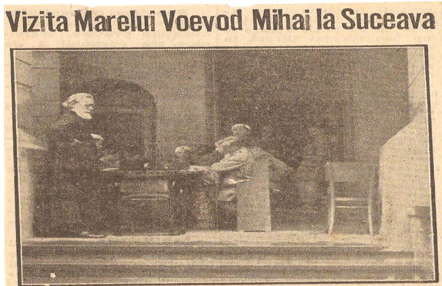
Fig. 4 – Mirăușilor Church. Front view. The Great Voivode with his colleagues discussing about religion.