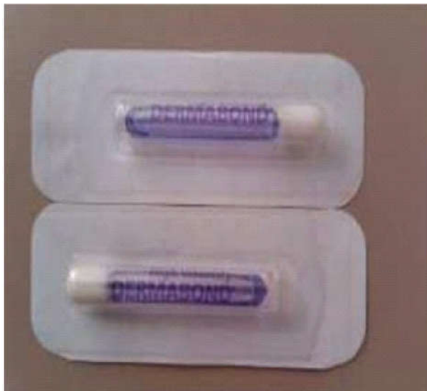
Fig. 1: Adhesive Glue

Traditionally, needle skin suturing with suture material is used because of cost-effectiveness. Now a days surgeons are looking for faster, comfortable and cosmetically better techniques for skin closure, moreover 2-Octyl cyanoacrylate is easier to use and provides a flexible, water resistant, sealed skin closure. It provides a needle-free method of wound closure, an important consideration because of blood-borne viruses (e.g., HIV). It requires no bandaging due to its antimicrobial properties. From the patient's perspective, it gives less pain during the post-operative period, patients can even have a shower, needs no suture or staple removal, disappears naturally as incision heals and leaves no mark. Cyanoacrylates typically fix within a minute and achieve full bond strength in 24 hours [1].